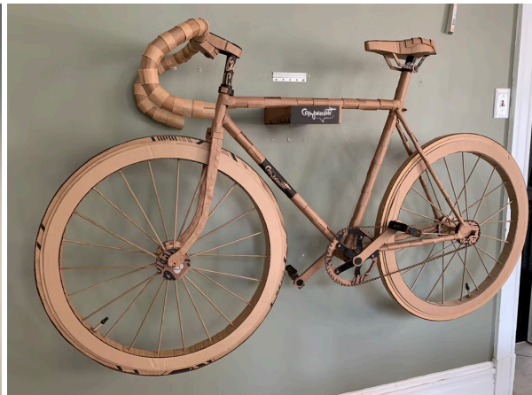
2019 Art Collaboration Sponsor: Companion Bakery